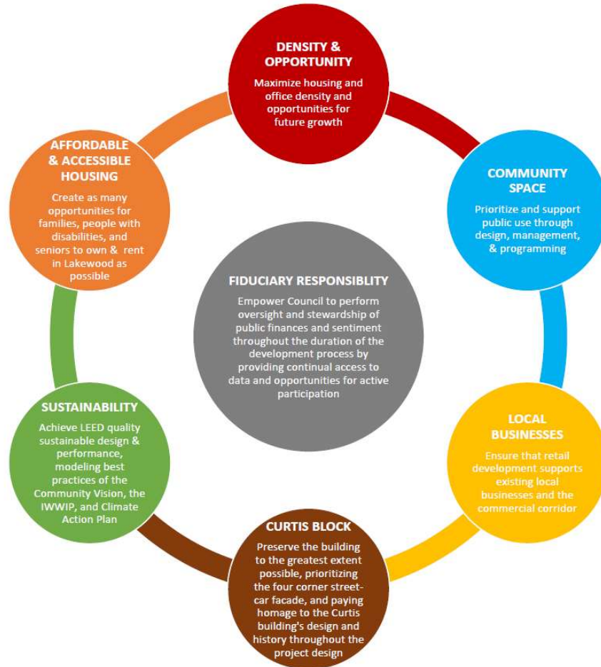
Council Downtown Development Priorities